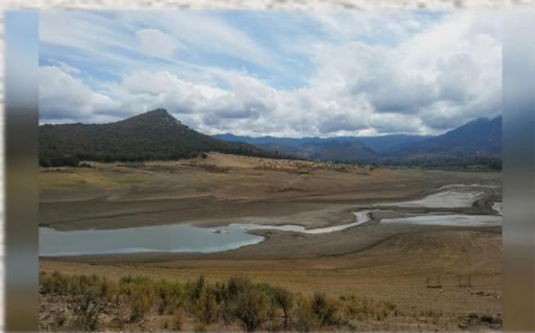
EMIGRANT LAKE 2020