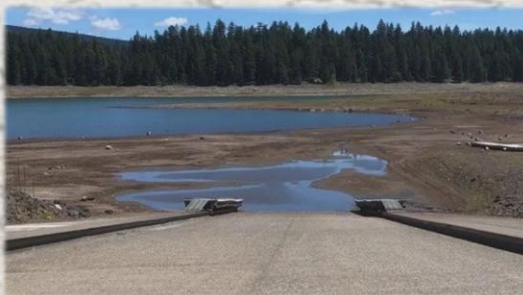
HOWARD PRAIRIE LAKE 2020