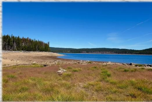
FOURMILE LAKE 2025