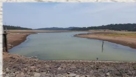
HYATT LAKE 2021