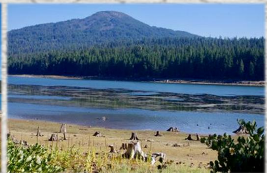
FISH LAKE 2023